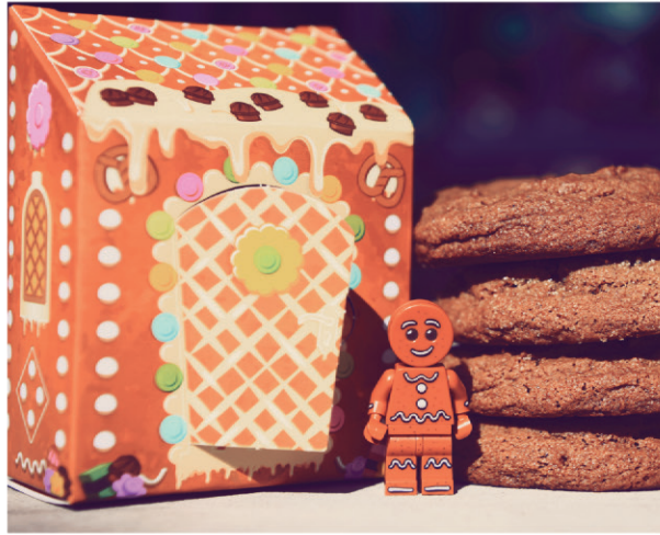
DECEMBER 12 Gingerbread House Day

Gingerbread house building is the ultimate in playing with your food. I've never been one to make a gingerbread house myself, but I love the ones created by others. I'm more about making plain gingerbread and eating the candy decorations along the way.