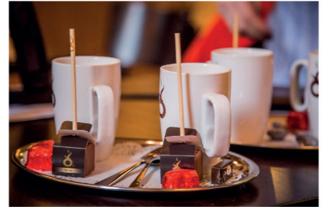
DECEMBER 13 Cocoa Day

Hmmm, a good day to start the week! You can't beat a warm cup of cocoa on a winter day. But hang on, mostly we have hot chocolate not a drink of cocoa.