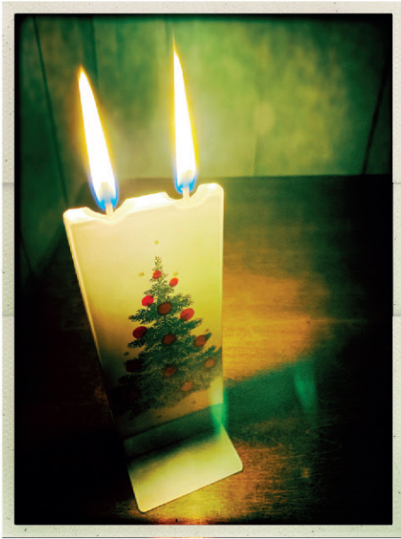
DECEMBER 11 App Day

In the midst of the holiday rush, sometimes we don't have the time to spend editing our photos. Those days call for a "snap it and app it" approach...take a quick photo and use an app to edit.